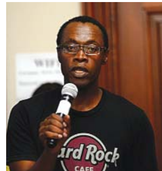
A PARTICIPANT AT THE CCR PUBLIC DIALOGUE "SOUTH AFRICA'S CORPORATE EXPANSION IN SOUTHERN AFRICA", HELD AT THE CENTRE FOR THE BOOK, CAPE TOWN, 22 MARCH 2017.

Concerns were raised about the impact of a South African market-led integration approach, and protecting South Africa's workforce against regional markets.