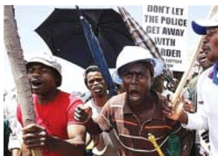
STRIKING MINERS AT ANGLOGOLD ASHANTI MINE NORTH OF JOHANNESBURG, IN NOVEMBER 2012.

6 COSATU (the Congress of South African Trade Unions), South Africa's largest trade union, had long been a regional economic anchor, but also faced huge struggles in fighting labour oppression. 9