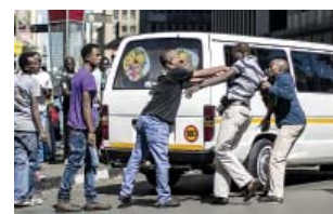
A TAXI DRIVER IS PUSHED AROUND DURING A CONFRONTATION WITH FOREIGN NATIONALS IN JOHANNESBURG, IN APRIL 2015.

“The extent of regional investments by both the South African government and its corporate sectors has decreased recently, largely due to the spate of incidents of xenophobic violence in South Africa between 2008 and 2017, which have harmed prospects for regional corporate ventures and partnerships.”