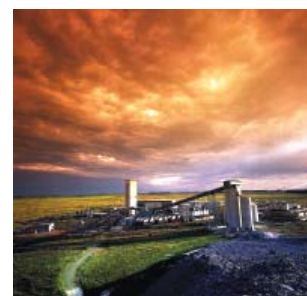
MOAB KHOTSONG GOLD AND URANIUM MINE IS PART OF ANGGOLD ASHANTI'S VAAL RIVER OPERATIONS IN SOUTH AFRICA. IT REPRESENTS ONE OF THE LARGEST URANIUM RESERVES IN SOUTH AFRICA HAVING ESTIMATED RESERVES OF 57.2 MILLION TONNES OF ORE GRADING 0.058% URANIUM.

South Africa is situated in a region rich in mineral resources, with gold, platinum, and other precious metals found in its own backyard.