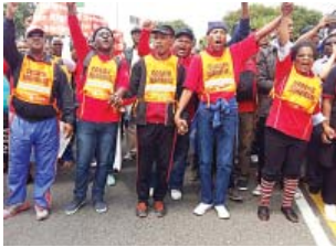
THE CONGRESS OF SOUTH AFRICAN TRADE UNIONS EMBARKING ON A NATIONAL STRIKE IN OCTOBER 2017.

Trade unions must become vehicles for eradicating poverty and building the necessary regional economic integration platforms; as well as creating conditions that are conducive to institution-building, for both governments and businesses.