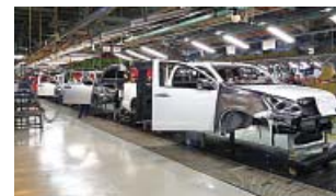
THE HEADQUARTERS AND ASSEMBLY OPERATIONS OF GENERAL MOTORS SOUTH AFRICA, IN PORT ELIZABETH.

South Africa’s shut-down of its motor vehicle investment plant in the Eastern Cape region – and General Motors’ exit from the country, and the withdrawal of their business investment from South Africa could be seen as an opportunity for promoting vehicle manufacturing in the region, with South Africa as an anchor.